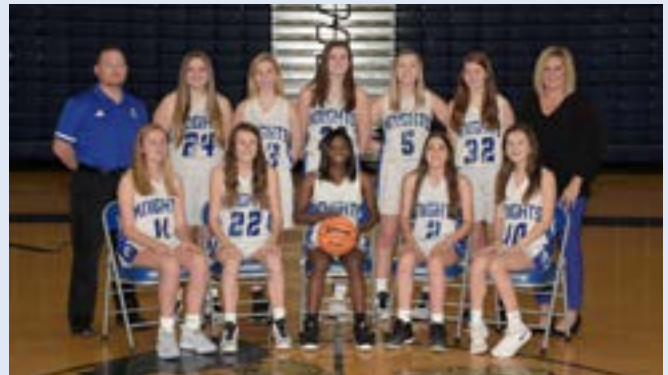
JV Girls Basketball Team