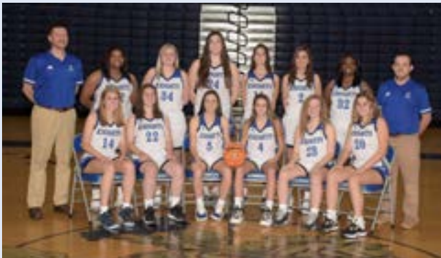
Varsity Girls Basketball Team