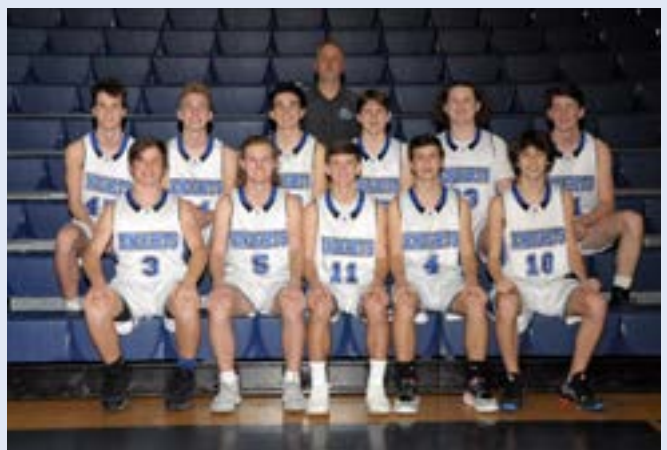
JV Boys Basketball Team