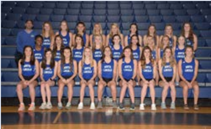
Girls Winter Track Team