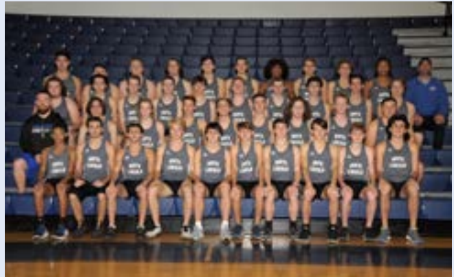
Boys Winter Track Team