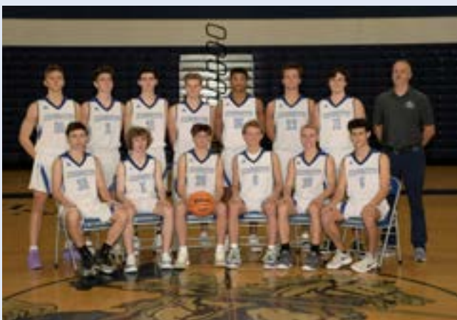
Varsity Boys Basketball Team